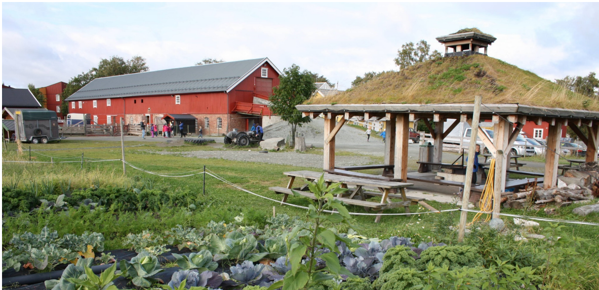
Voll farm, photo: http://vollgard.no

Wear walking shoes and clothes according to the weather.