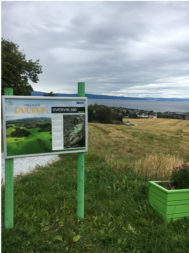
The Overvik area, where 2500 houses are planned.