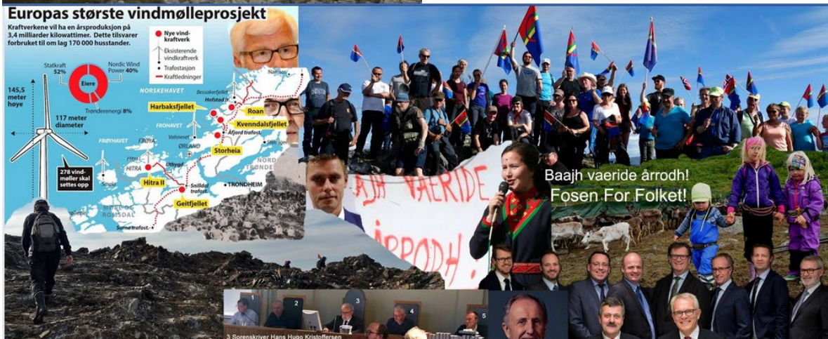
The Facebook group: Fosen for the People