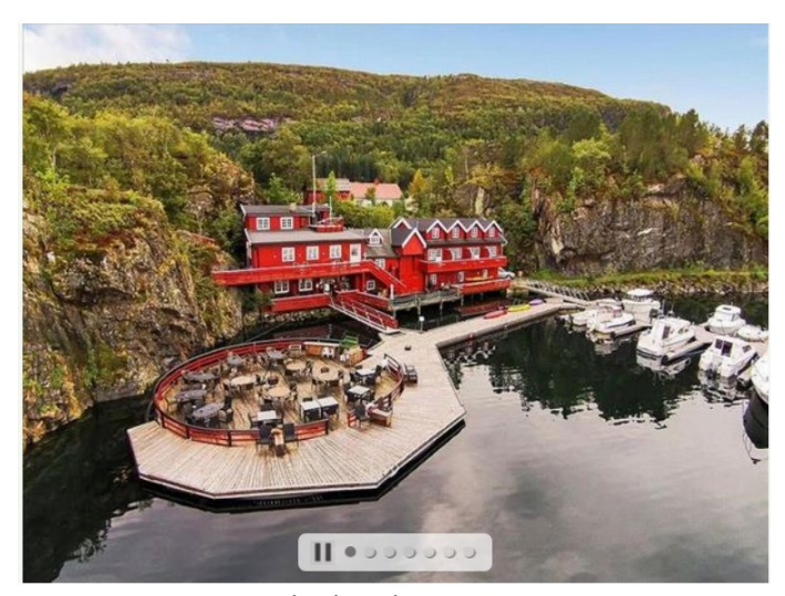
Kuringen Pier Hotel – lunch.